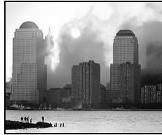
New York City, 2001