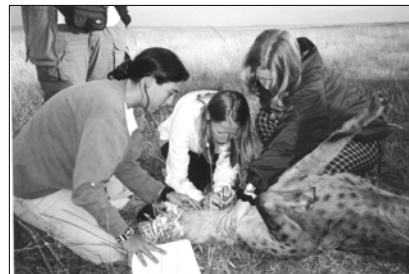
MSU students with their faculty leader, Kenya