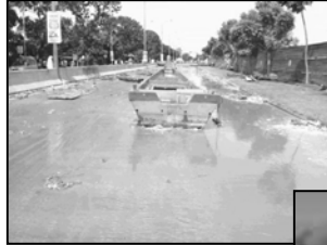
Penang, Malaysia, 2004